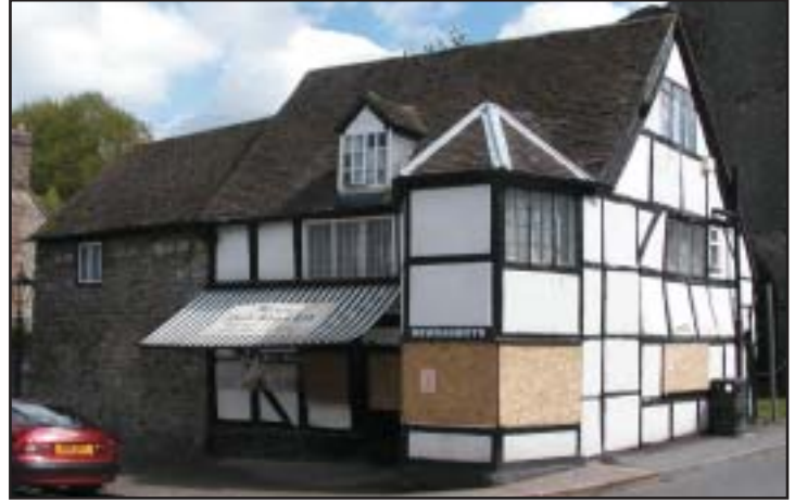
11 The Bull Ring, Much Wenlock, Shropshire TF13 6HS