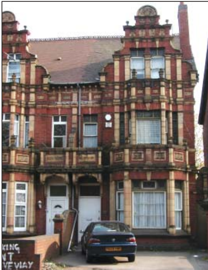
10 Trinity Road, Birchfield, Birmingham B6 6AG