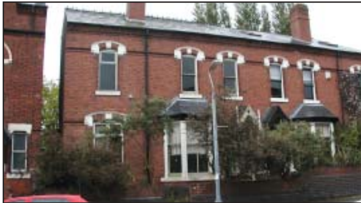
24 Holly Road, Edgbaston, Birmingham, B16 9NH