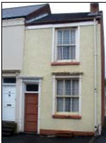
12 William Street, Brierley Hill, West Midlands DY5 3XH