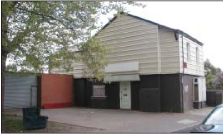
20 & 22 Malthouse Lane, Washwood Heath, Birmingham B8 1SP