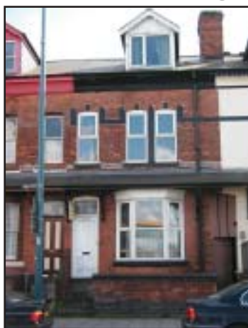
350 Dudley Road, Winson Green, Birmingham B18 4HJ