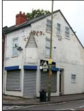
126 Icknield Port Road, Edgbaston, Birmingham B16 OBJ