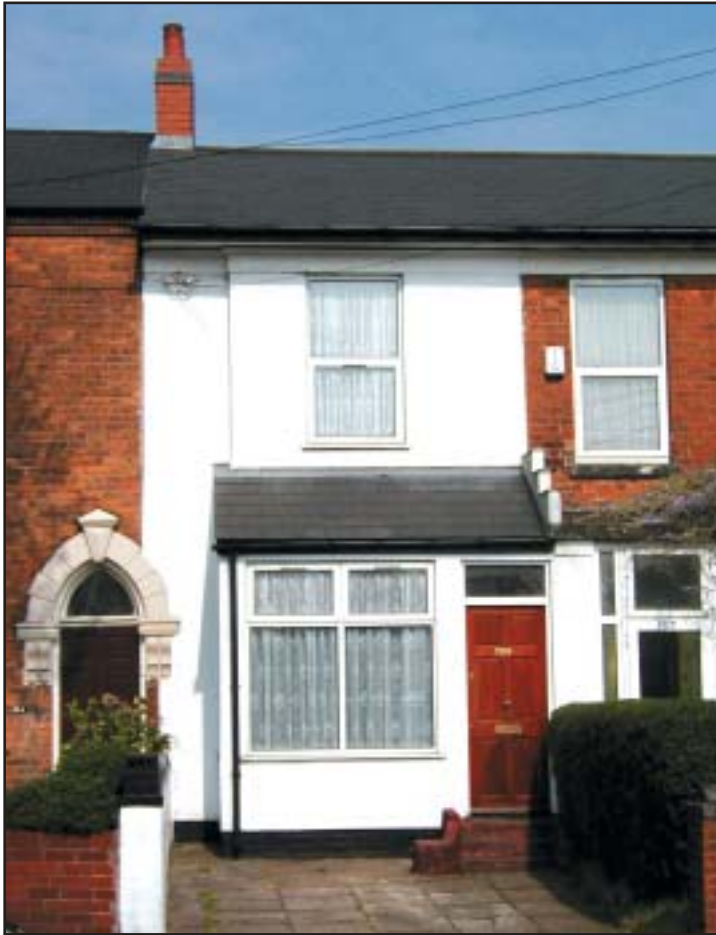
155b Heathfield Road, Handsworth, Birmingham B19 1JD