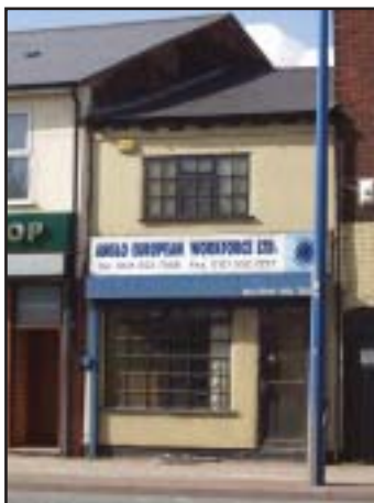
10 Birmingham Road, Oldbury, West Midlands, B69 4ED