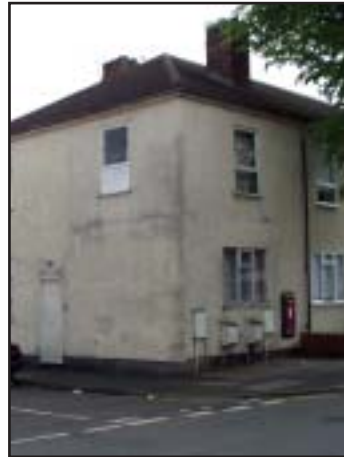
31a & 31b Vicarage Road, All Saints, Wolverhampton WV2 1DD