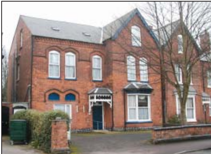
21 Clarendon Road, Edgbaston, Birmingham B16 9SD