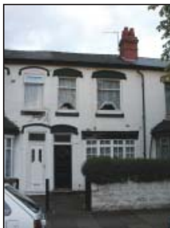
11 Sandbourne Road, Ward End, Birmingham B8 3NT