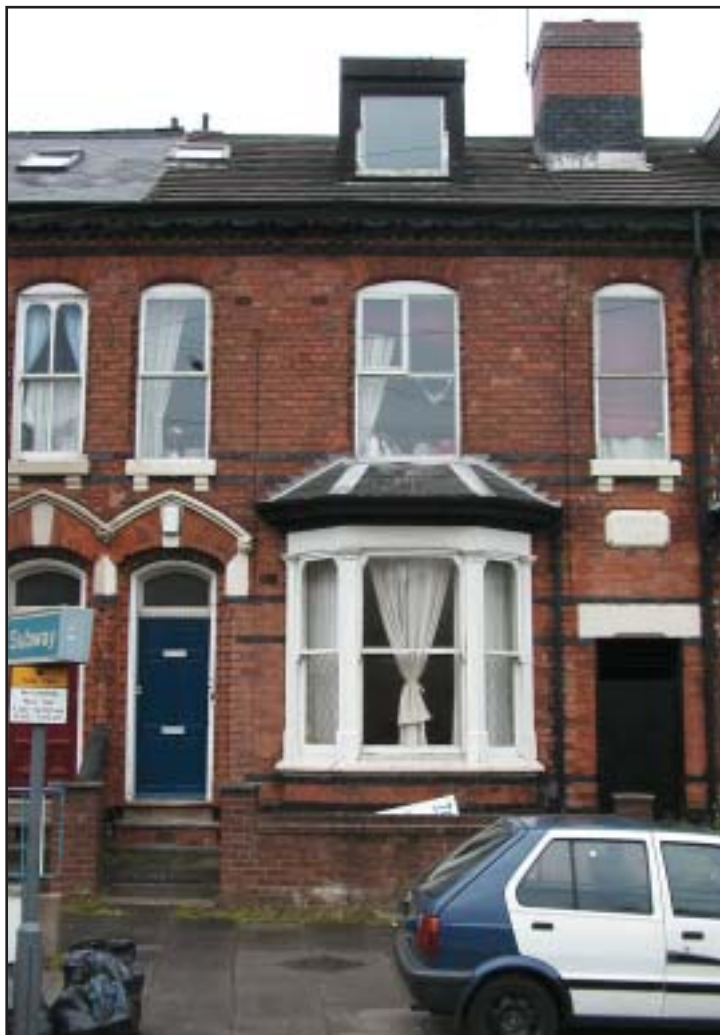
133 Birchfield Road, Perry Barr, Birmingham B19 1LH