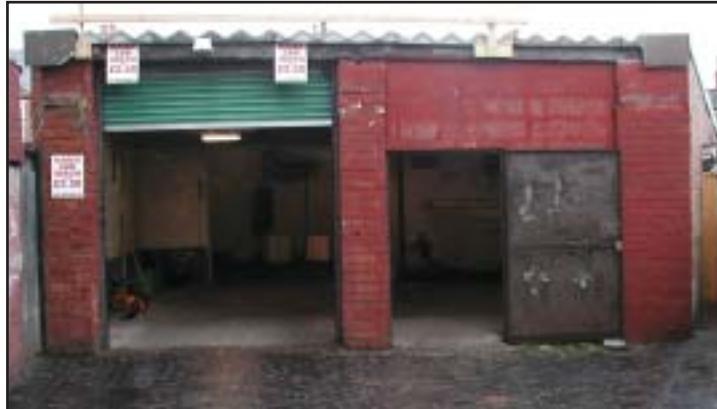
53a Capethorn Road, off Waterloo Road, Smethwick, West Midlands B66 4LY