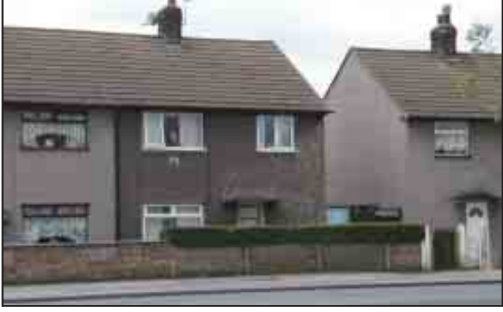
64 Brookway Lane, Parr, St Helens, Lancashire WA9 3RJ