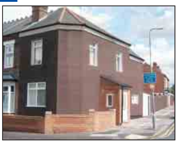
45 Albert Road, Stechford, Birmingham B33 9BD