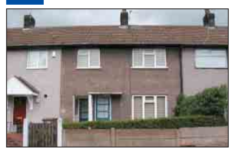
83 Brookway Lane, Parr, St Helens, Lancashire WA9 3RL