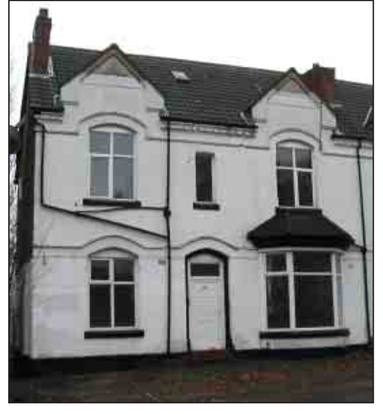
40 Prospect Road, Moseley, Birmingham, B13 9TB