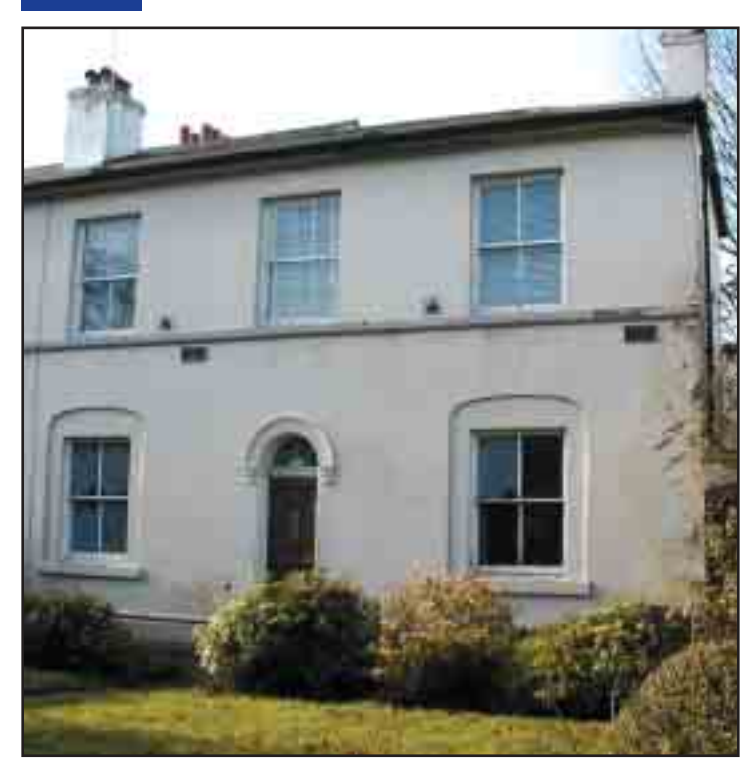
2 Windsor Terrace, Hagley Road, Edgbaston, Birmingham B16 8UH