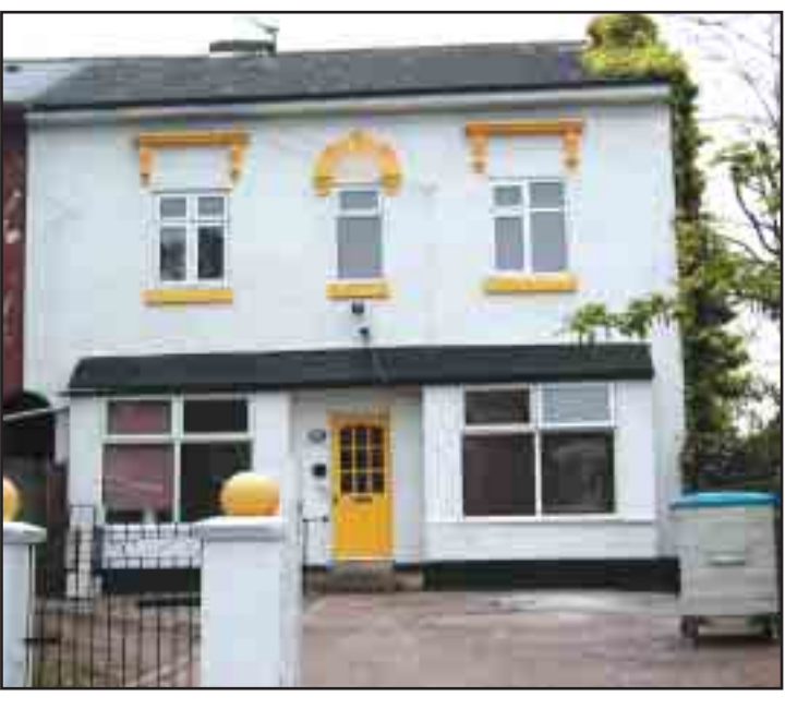
59 Frederick Road, Stechford, Birmingham B33 8AE

Find us on the web @ www.cottons.co.uk E-mail: auctions@cottons.co.uk