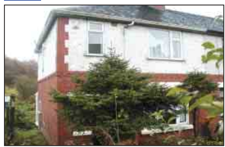
290 Sneyd Street, Sneyd Green, Stoke on Trent, Staffordshire ST6 2NP