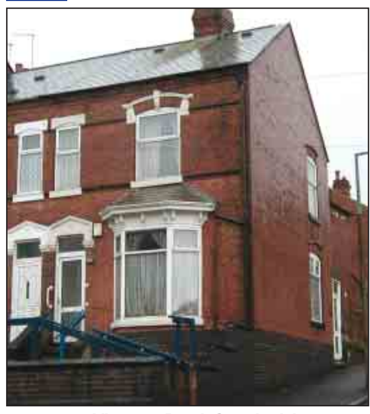
75 Vicarage Road, Smethwick, West Midlands B67 7AQ