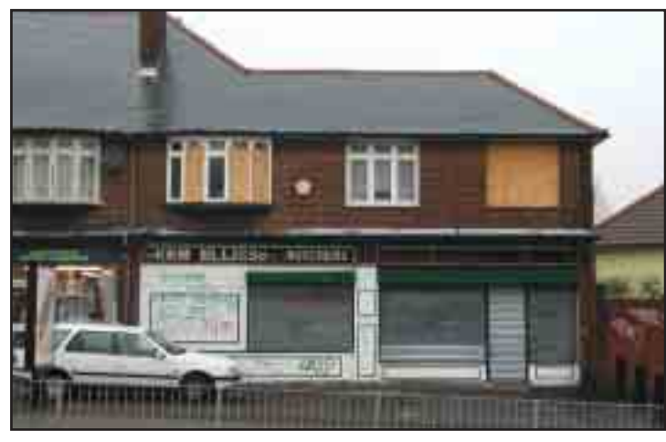
244/244a School Road, Yardley Wood, Birmingham B14 4HA