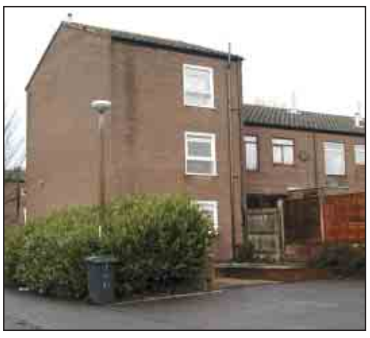
144 Caledonian, Glascote Heath, Tamworth, B77 2EH

DMI Finance, PO Box 3000 Calne, Wilts., SNII OXZ Tel: 01249 822 999 Fax: 01249 822 211