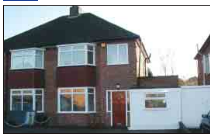
10 Kendrick Road, Walmley Ash, Sutton Coldfield B76 1EG