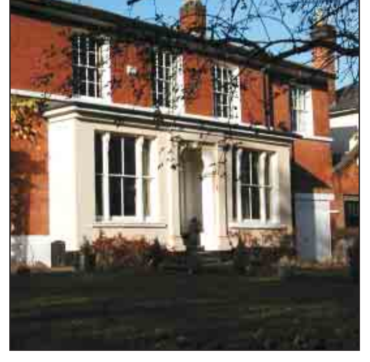
211 Bristol Road, Edgbaston, Birmingham B5 7UB