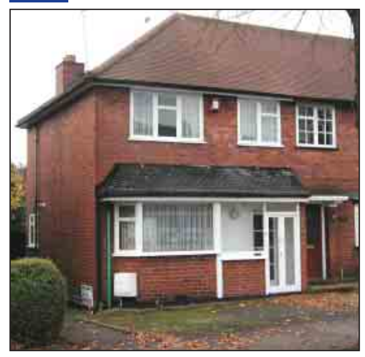
89 Hathersage Road, Beeches Estate, Great Barr, Birmingham B42 2RY