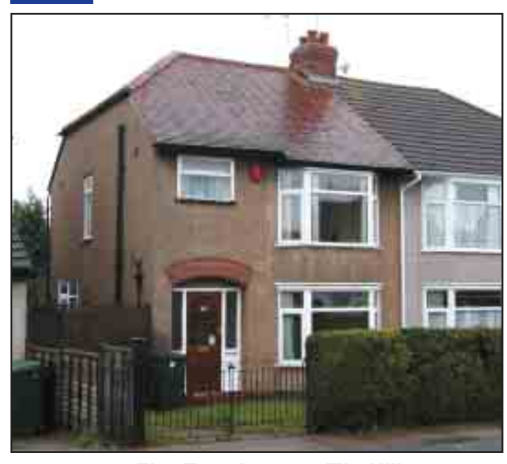
39 Elm Tree Avenue, Tile Hill, Coventry CV4 9EU